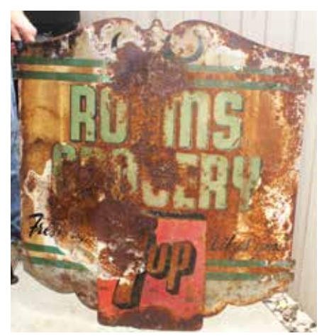
UNCOVERING HISTORY: While salvaging the past, the crew sometimes comes upon interesting history. This is a sign from the former Rohms Grocery that the crew found buried in the basement of the Village News building.

working on projects as there are very few people who know how to operate a gunite machine.